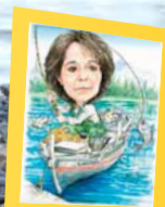
Ms. Damanaki Fisheries Commissioner